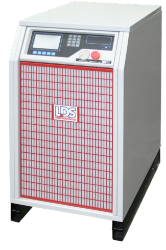
LDS HPAK Amplifier

The HPAK amplifier is a dedicated 5 kVA unit optimised for use with the LDS V650 Series and V780 Series shakers to deliver greater force than if using the LPA1000 amplifier. This compact unit delivers the power for both the shaker and field coils, as well as power for the cooling fan.