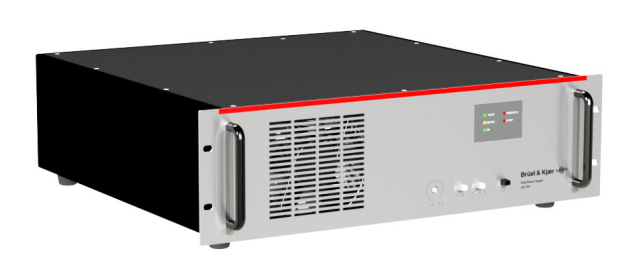
LDS FPS Field Power Supply

The FPS field power supply is designed to provide the dc power requirements of the field and degauss coil for the following LDS shakers: V555 Series, V650 Series, and V721 Series, and to operate with the LPA1000 amplifier.